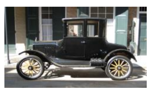
Figure 1: Ford Model T

Transportation engineering, a subset of civil engineering, is an engineering discipline that involves moving people and goods in a safe, efficient, economical, and environmentally-friendly manner. Transportation engineers are frequently tasked with designing roadways for all vehicle types and non-motorized users; selecting appropriate signs, pavement markings, and other traffic control devices; evaluating traffic movement; and programming traffic signals. While some transportation engineers focus on motorized traffic (like cars, trucks, and buses) and non-motorized traffic (like pedestrians and bicyclists), some transportation engineers work with other modes of transportation such as railroad systems