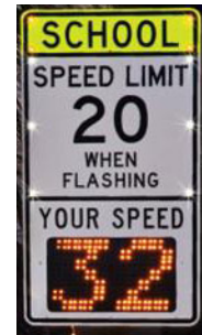
Figure 2: Speed feedback sign for a school zone.

schools (especially during early dismissal days)