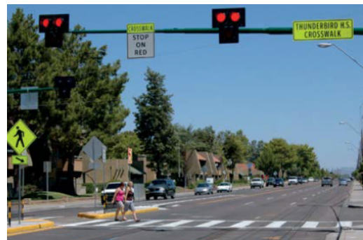
Figure 3: High-intensity Activated crosswalk (HAWK signal)

http://safety.fhwa.dot.gov/ped_bike/tools_solve/fhwasa14014/